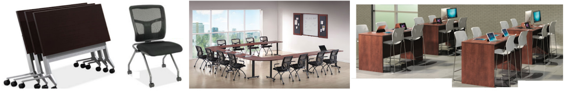
Commercial Swivel Chairs