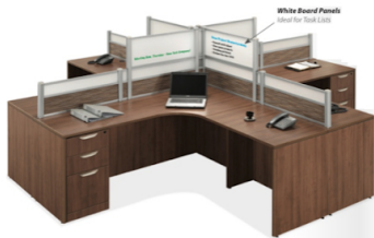
White Board Panels Mount for Desk Legs