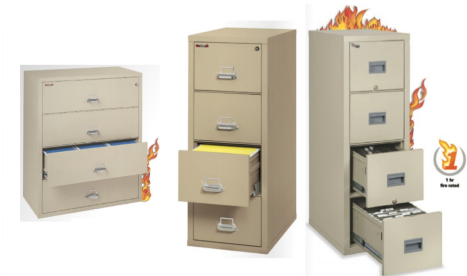
Metal Storage and Desks