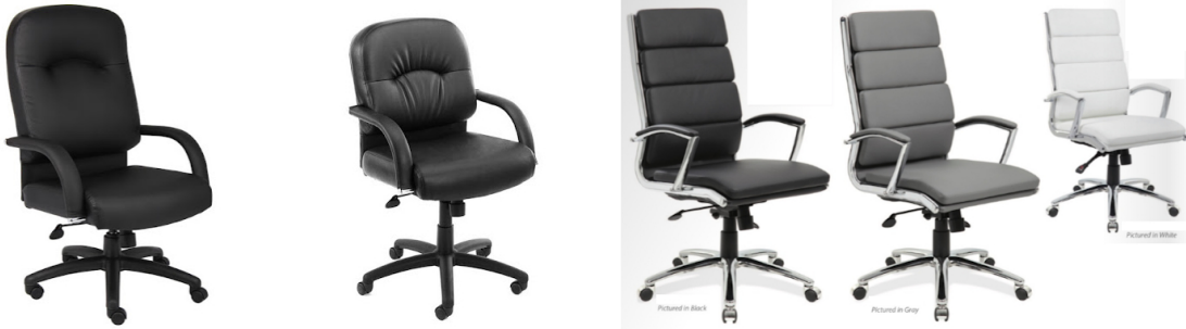
Ergonomic Perch Seating & Floor Mats