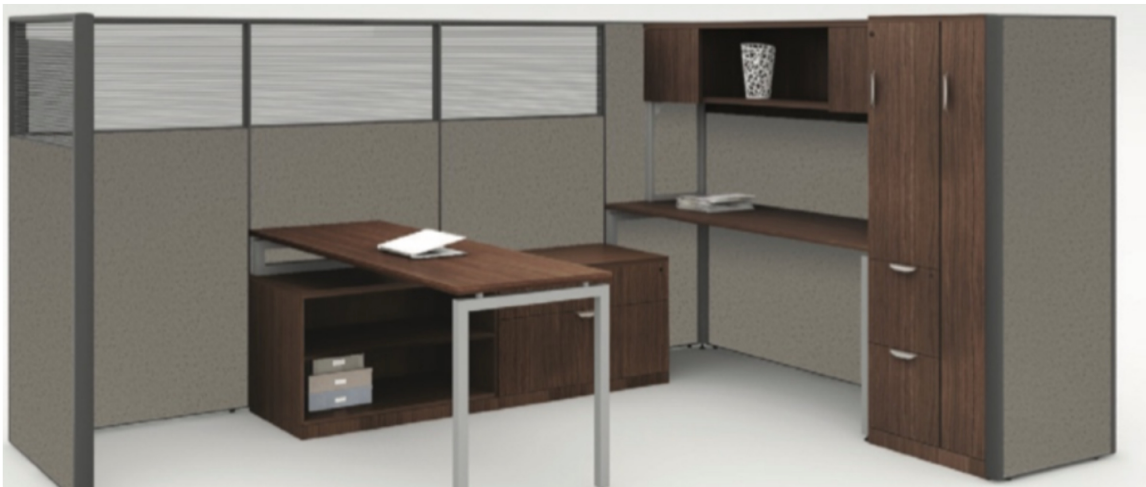
Modular Desk Collection