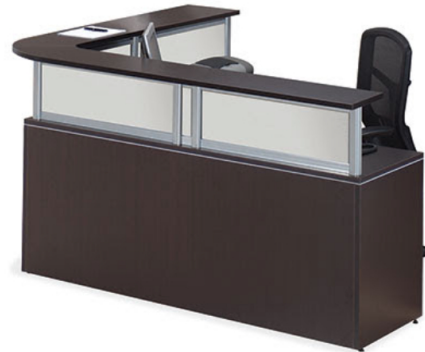
Non Powered Panels for Case Goods