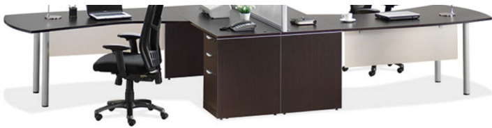
Transaction Tops for Panel Dividers